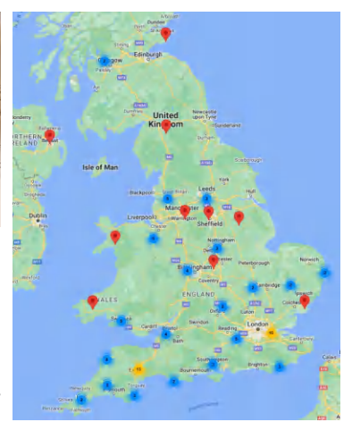
Boost your business with a web directory

This session will look at the use of floor plans in EPC surveys and the extended opportunities to earn from them.